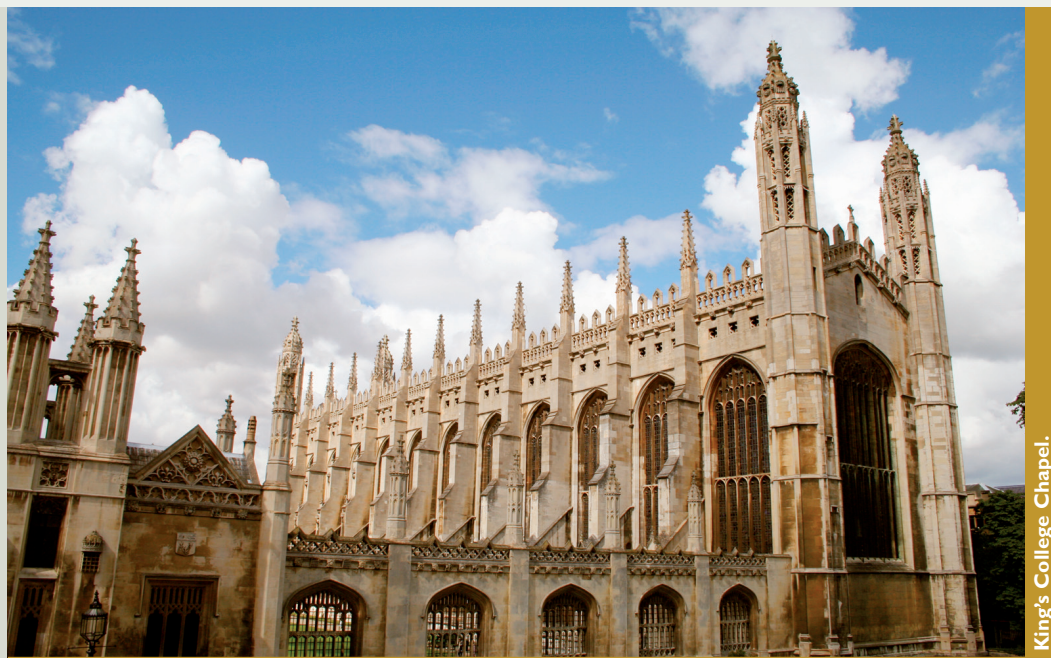
King's College Chapel.

In 1446, Henry VI laid the first stone of King's College Chapel. This building is indeed a very famous Cambridge landmark. It is from this Chapel, since 1918, that the Christmas Eve Service of Nine Lessons and Carols has been broadcast worldwide by the BBC. The Mayor of Cambridge attends this service each year and processes behind the Great Mace from the Guildhall to the Chapel. The Mayor is invited to read a lesson at this Service.